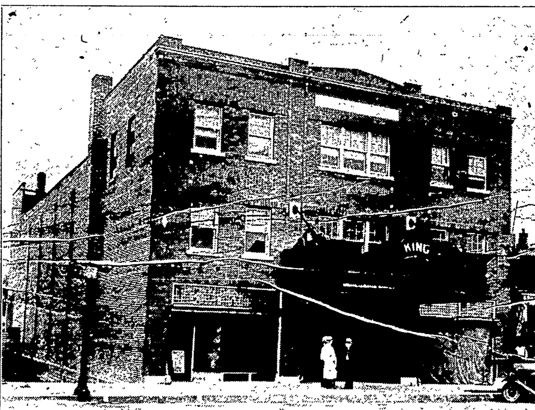
Front View of the New Mansfield Building